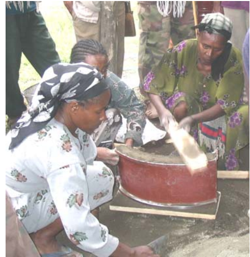
Ethiopian women moulding new Injera oven