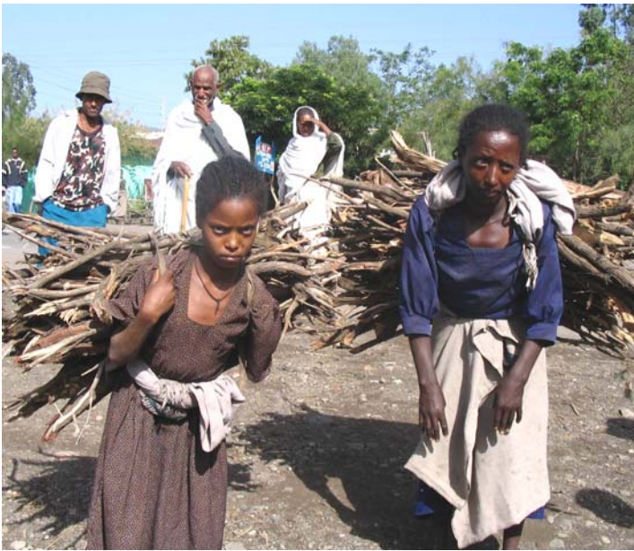
Ethiopian women carrying firewood.

work for rural women who often go on foot as far as 25 kms. to gather firewood and then return carrying bundles of wood that weigh more than 30 kgs. It is literally back breaking work, with the women stooped over like question marks.